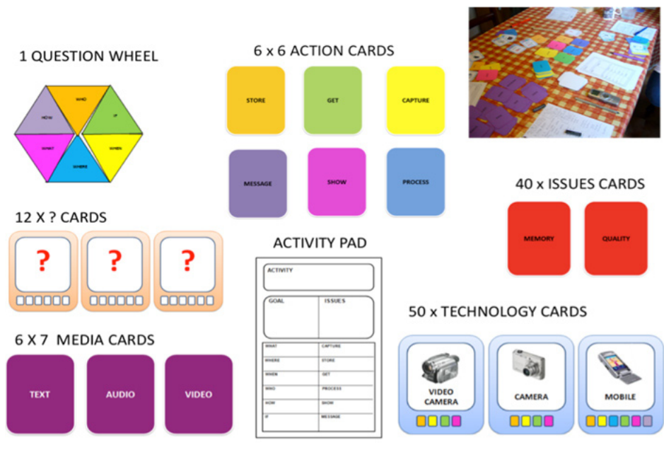
Fig. 2 - The card game after 5 design iterations

The five design process iterations that were competed in the development of the game can be summarised in the following manner from the participatory design perspective: